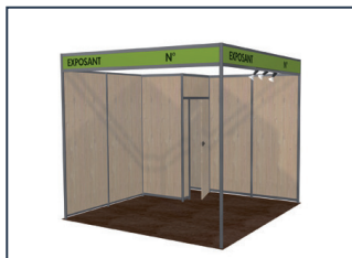
Visual not contractual